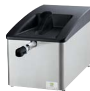
Extreme™ Condiment Dispenser 07500

The Server Extreme™ dispenses portion-controlled condiments from bag-in-box or Vol-Pak® packaging using an adjustable, ADA compliant lever. The Extreme™ allows you to streamline high-volume operations without the hassle of a CO 2 system and speeds transaction times by creating a self-serve station away from point-of-purchase.