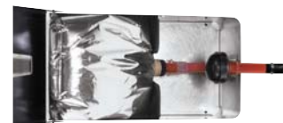
Open view with pouch