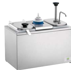
Custom SB-3 station

Don't see the station you need here? Try using our Custom Fountain Jar Station Guide!